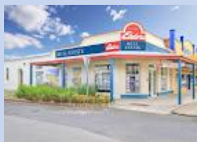
Yarram Real Estate

Yarram Women on Farms Gathering 2023 would like to thank all our sponsors, we are very grateful that you gave so willingly when approached. The money provided by you was the difference between us struggling to make ends meet and being able to have a surplus of about $10,000.00.